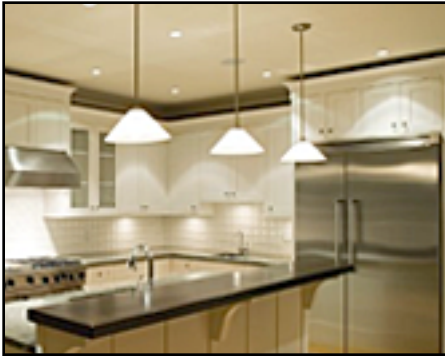
Kitchen Task Lighting

One of the newer kitchen countertop trends is concrete. It's extraordinarily sturdy, and because of its slightly rough appearance, dings and dents are no big deal. Plus,