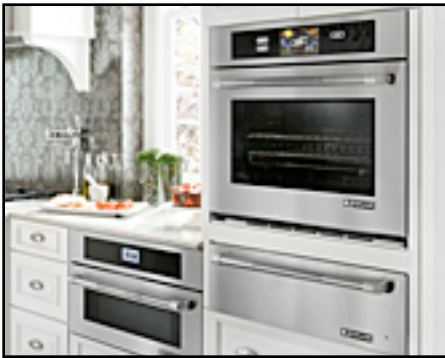
Double Stainless Steel Oven

When working with your contractor, discuss with them which is the best option for your kitchen design.