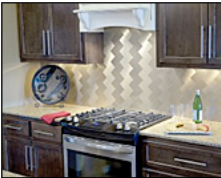
Back Splash Metal Panel

Panels made out of metal, laminate, wood are another options. Pre-made panels are available in several colors and designs.