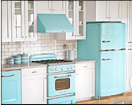
Retro Kitchen Design

counters. Energy efficient appliances also help you save money off the cost of monthly utility bills. Adding high end appliances brings beauty and function to your new kitchen design.