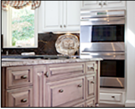
Luxury Kitchen Design

Once you narrow down your list review any contracts to ensure that the plans meet your expectations