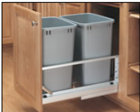
Island Organization Space