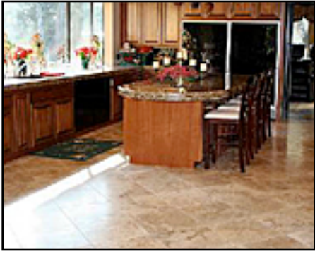
Stone Kitchen Floor

Pay attention to the quality of construction of drawers as these tend to receive heavy use. Make sure the materials used on your drawers and the areas that support them are solid construction.