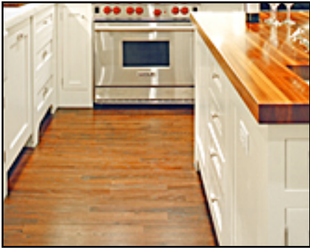
Enviro Friendly Cork Floor

Like stone, tile can be hard on the legs and be loud compared to wood. Design options are unlimited in