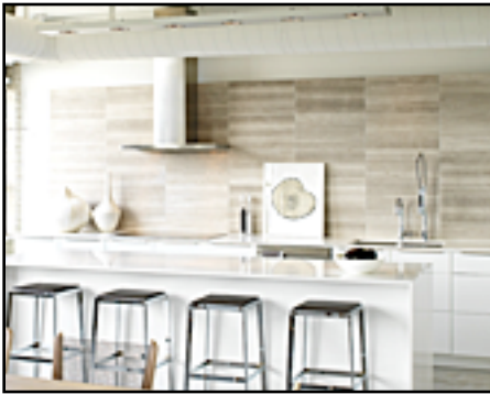
Enviro Friendly Kitchen