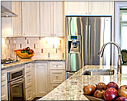
Luxury Kitchen Design

The latest appliances make your kitchen completely luxurious. Stainless steel are a popular choice for modern kitchens. For a warmer kitchen design, consider appliances that blend with dark wood, stone and