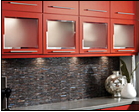
Stylish Kitchen Cabinets

not, then you will want to seriously consider replacing them. If they are, then here are some options.