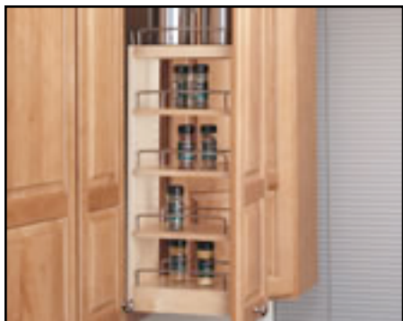
Smart Kitchen Storage