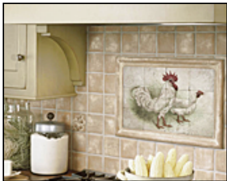
Designer Tile Splash

Even if your budget is small, you can get big results from minor kitchen renovations. Consider remodeling rather than tearing out your entire kitchen. Assess the “target” areas you want to improve or make more efficient. Once you know what you want, you’re ready to transform your kitchen into an edible oasis.