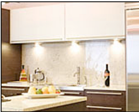
Kitchen Ambient Lighting

Once you decide the lighting you prefer, your contractor can help you with all the other aspects of your kitchen remodeling project.