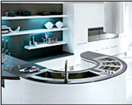
Modern Kitchen Design

If you long for all the latest conveniences, a modern kitchen design is perfect for your fast-paced lifestyle. Have updated technology at your fingertips, sparkling counter tops and clean lines with a modern kitchen design.