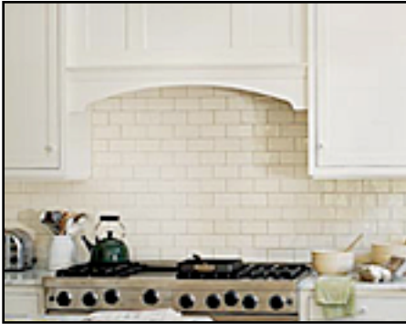
Subway Tile Back Splash

Tile has been the standard material used for back splashes and is one of the more economical materials to use. Tile is produced in ceramic, porcelain, engineered stone, stone and metals, and provide a wide option in terms of color, texture and size.