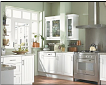
Small Kitchen Design

The first step if you are thinking about keeping the cabinets is to determine if they are structurally sound. If