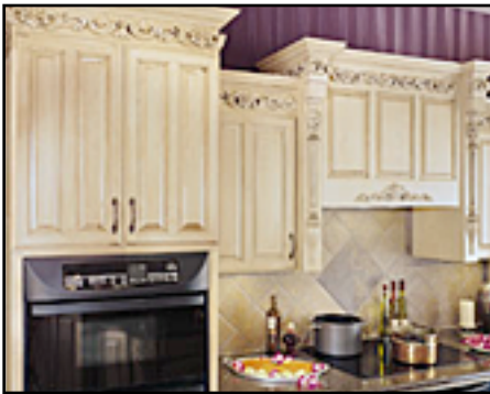
Custom Kitchen Cabinets

Custom: Custom cabinets have no limitations other than your budget. You can choose your size, color or finish, and materials used to build.