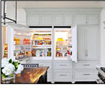
White Cabinet Set Refrigerator

preservation are important so look for options such as dual refrigeration, on door controls, external ice and water functionality, and of course energy savings features.